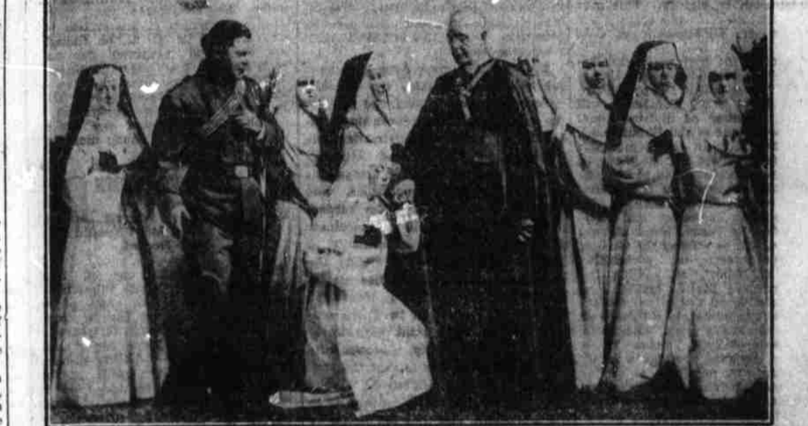
SCENE FROM VIOLA ALLEN'S GREATEST SUCCESS, "THE WHITE SISTER," AUDITORIUM, FRIDAY, OCTOBER 27.