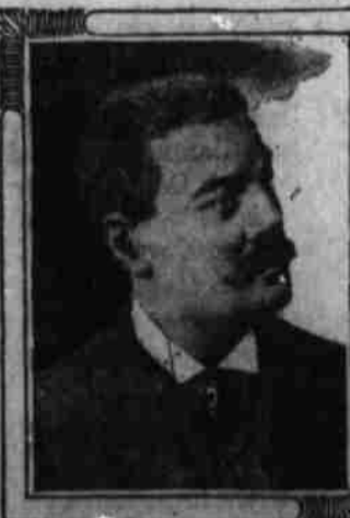
General P. Bonilla

Timing their move by the landing at Puerto Cortes of a rebel expedition from New Orleans, fifteen hundred troops, under the command of General Policarpo Bonilla, will invade Honduras within a few days from their base of supplies in Salvador and will begin in earnest the uprising which has been threatening along the border nearly a month.