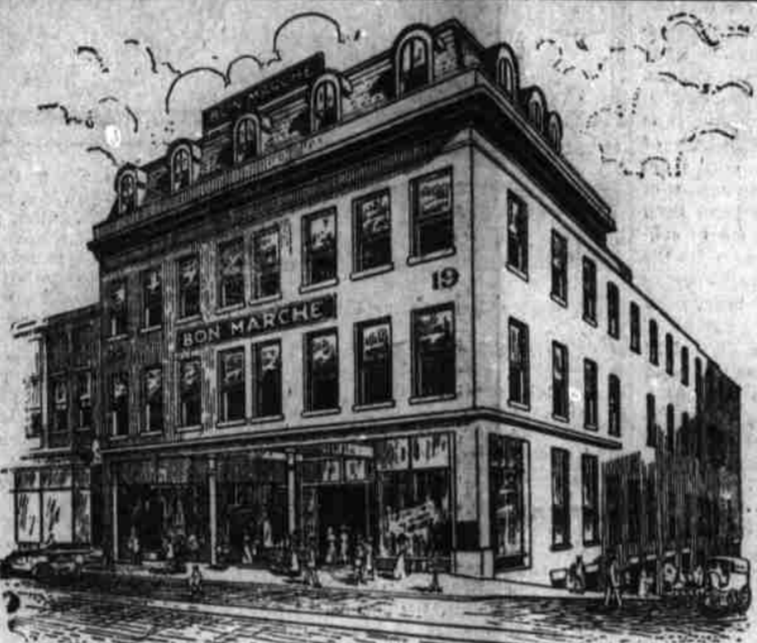
The "Christmas Store"

Other Handkerchiefs are here in wide profusion.