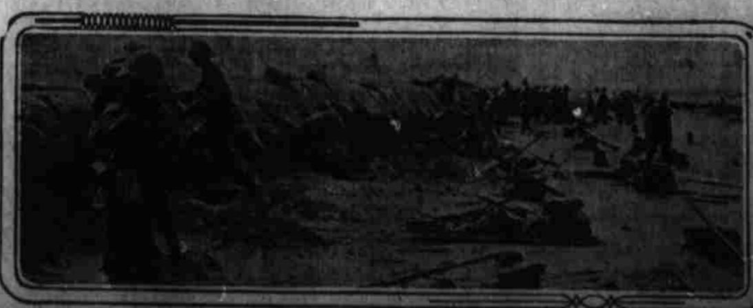
ITALIAN SOLDIERS ENTRENCHED ON THE OUTSKIRTS OF TRIPOLI. A correspondent at Tripoli cables that there is continued fighting by the enemy. The Tunis, he says, are shelling a strategic fire upon Hill Moud from their desert position, which is being shelled by the naval guns. The Red Cross corps, after clearing the field following a recent engagement, report that one thousand Arabs were killed.