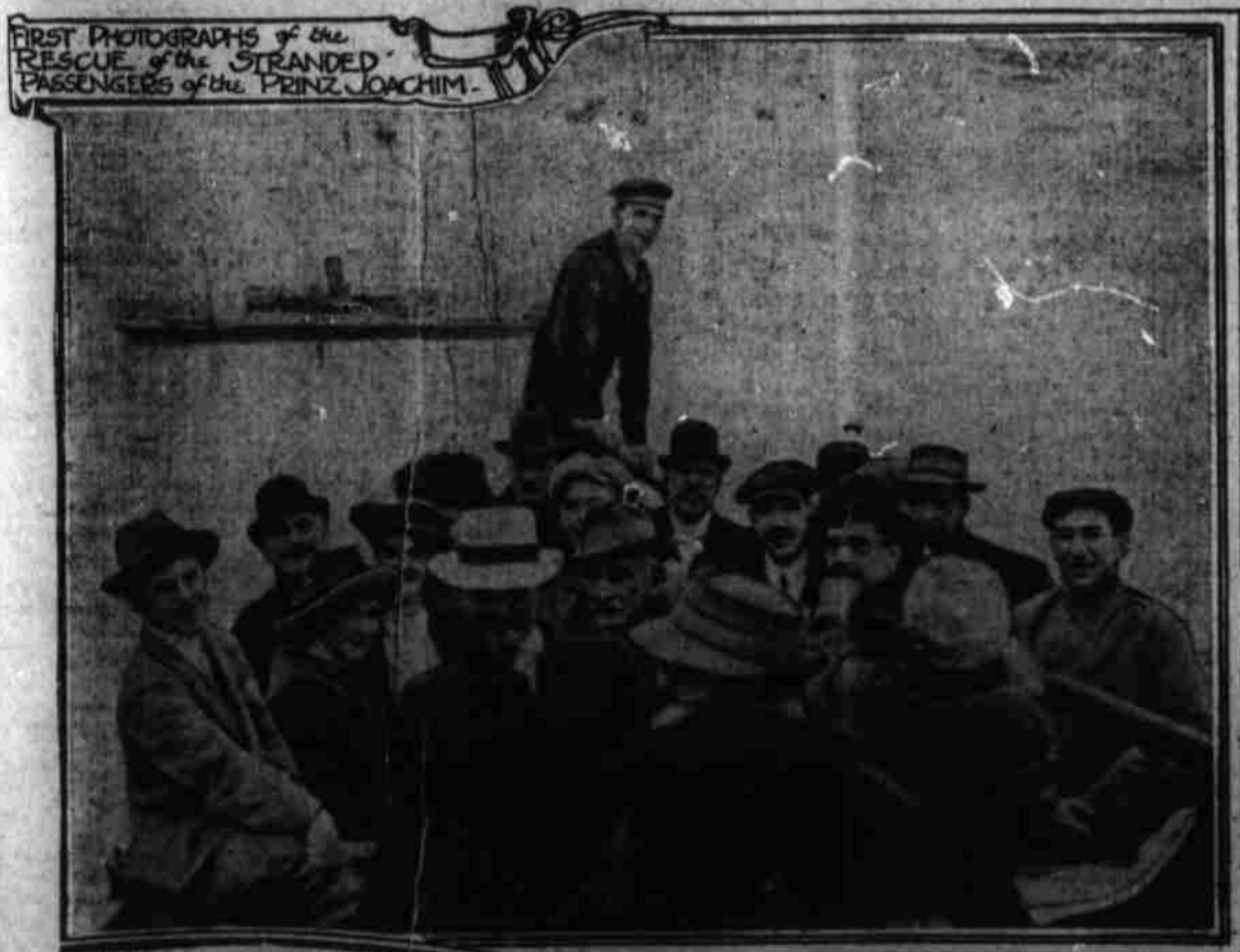
FIRST PHOTOGRAPHS of the RESCUE of the STRANDED PASSENGERS of the PRINZ JOACHIM.