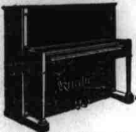
The Best Christmas Gift at