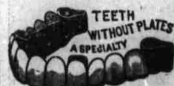
TEETH WITHOUT PLATES A SPECIALTY