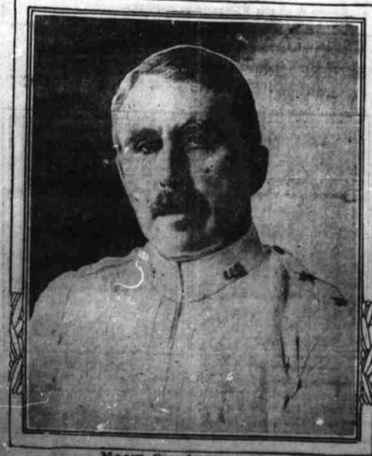
MAJOR GEN. LEONARD WOOD