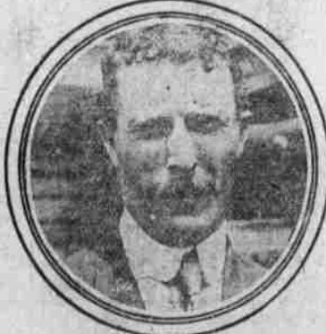
CAPTAIN "BOB" BARTLETT.

Friends of Captain Robert A. Bartlett, commodore of the steamship Roosevelt on Commodore Perry's dash to the North Pole, say that the explorer is planning an expedition into the Antarctic to reach "the bottom of the world." It is said that the expedition will start from San Francisco.