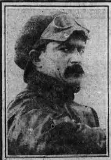
MONS JULES VEDRINE.

This is the Frenchman who, in his monoplane at the aerodrome at Pau, France, beat the world's speed record by covering a distance of eighty-eight miles in one hour.