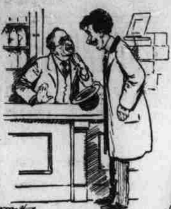
SHOWING HIS NEW CROP OF HAIR, THANKS TO THE REMEDY BOUGHT FOR HIS DOG.