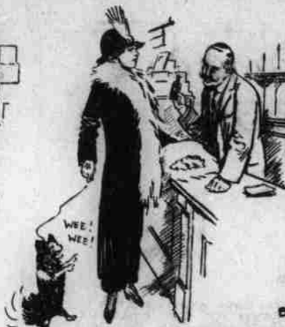
THE POMERANIAN WAGS HIS TAIL AND BARKS FOR JOY KNOWING THAT THE HAIR WASH IS PARTLY FOR HIM.