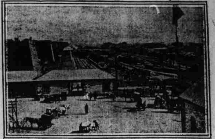
Martial law has been proclaimed in Pekin, and American troops are on the way to protect the American Legation. Looting mobs rule in Tien-tsin and the situation is very grave.