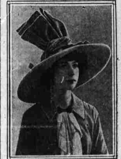
"Burnt bread" colored straw hat trimmed with ruby and black ribbon. Maison Ailx.

No Humorist—"What of his sense of humor? 'Well, he has to see a joke twice before he sees it once.'" —Lippincott.