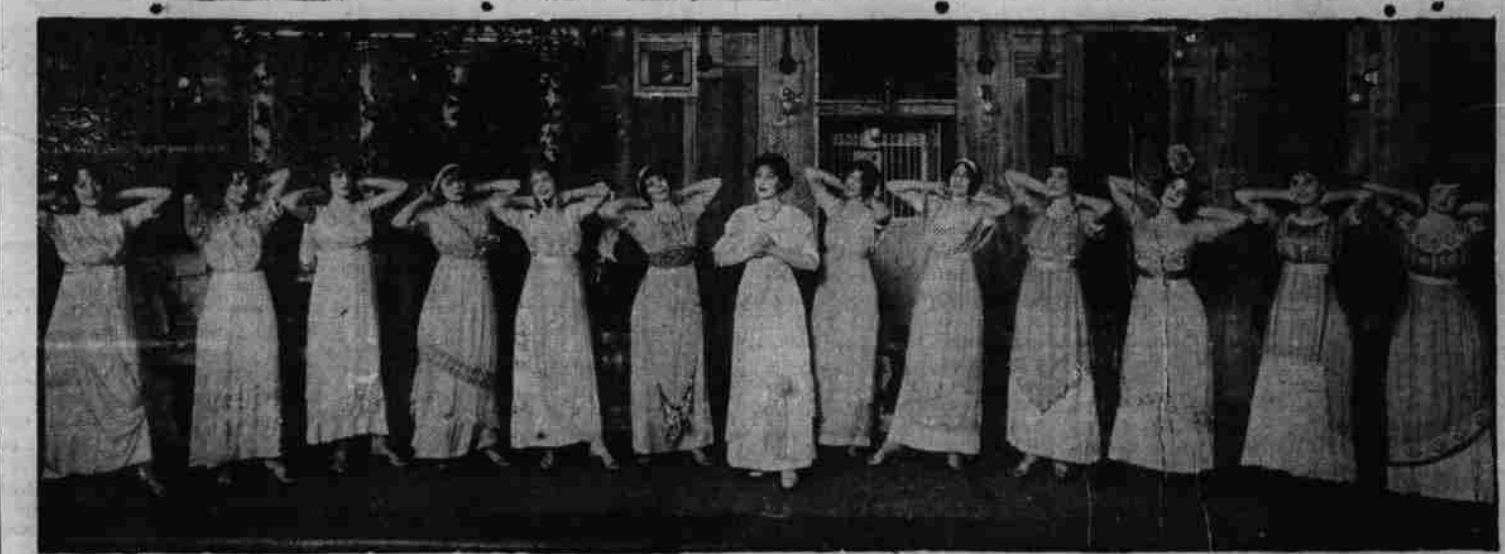
GRO UP OF CHORUS GIRLS WITH "THE HEART BREAKERS," MATINEE AND NIGHT, MONDAY, DECEMBER 16.