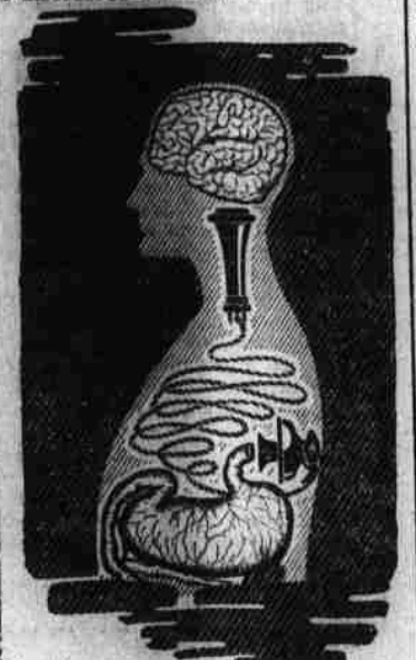
The Stomach Sends a Message to the Brain the Instant There is Trouble.

Thousands of people who hadn't really enjoyed a meal for years have given their stomach a new lease of life through the wonder-workers, Stuart's Dyspepsia Tablets. They promptly put an end to flatulency, heartburn, indigestion, sick headache, dyspepsia, burning, sensation, brush, fermentation and the other ills attendant upon a disordered stomach.