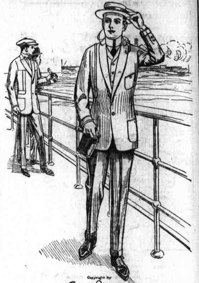
Superior-Tailored Clothes Rochester, N.Y.