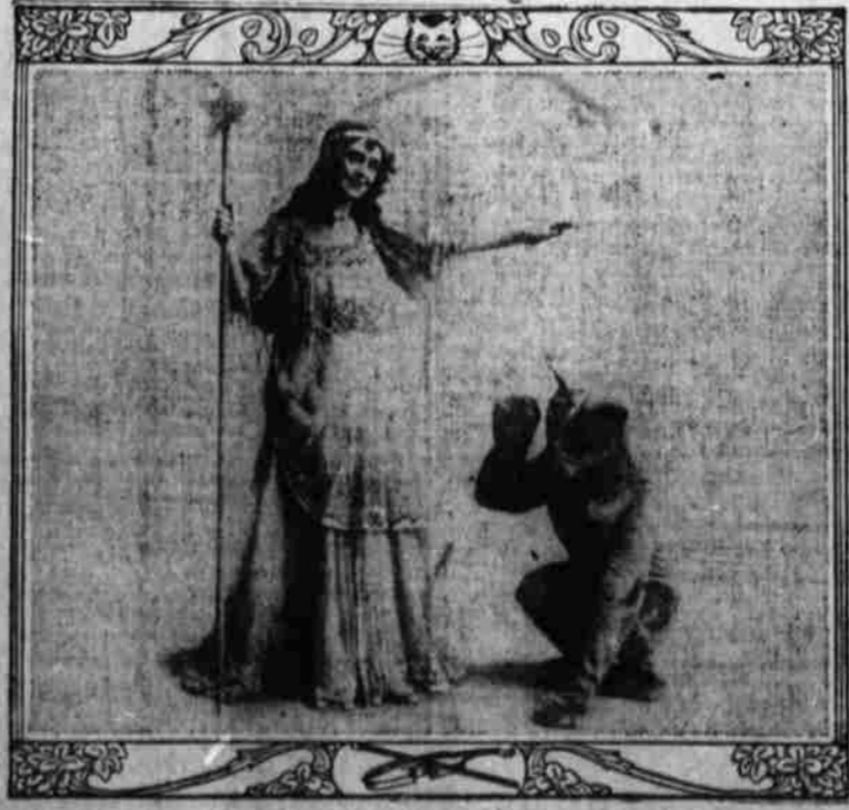
SCENE FROM "THE CAT AND THE FIDDLE" COMING TO THE MAJESTIC TOMORROW, FRIDAY AND SATURDAY.

Best Show for the Price Ever In Asheville