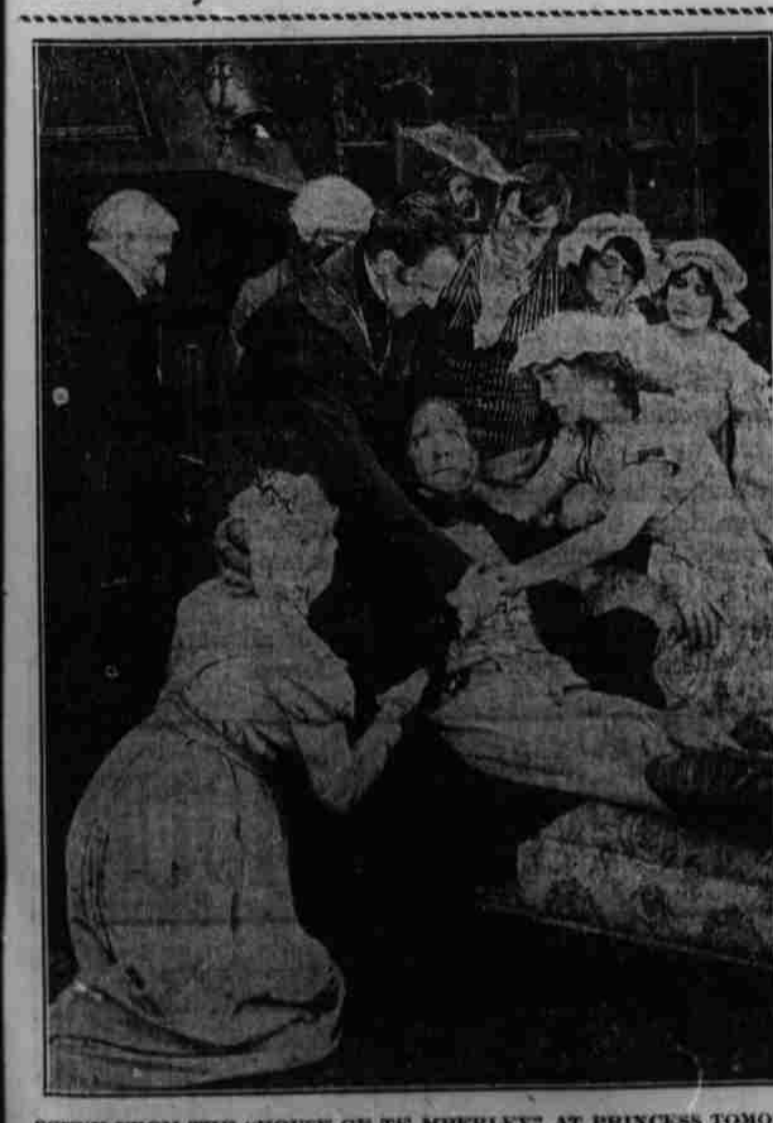
SCENE FROM THE "HOUSE OF THE MERLEY" AT PRINCESS TOMORROW.

No. 3. The Atlantic Ocean, a water sprite riding on a helmeted dolphin and grasping in her hand a trident a flying fish and twisted sea serpent, representing submarine communications. Her head dress is hung with shells and corals. The helmet of the dolphin is symbolical of triumphant navies and armored merchantmen.