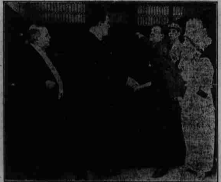
SCENE FROM "THE MAKING OF BOBBY BURNIT" AT THE GALAX TOMORROW.

TWO NIGHT PERFORMANCES ..... 7:15 and 9:15 MATINEE DAILY, 3:15, PRICES ..... 10, 20 and 30c NIGHT PRICES ..... 20, 30 and 50c