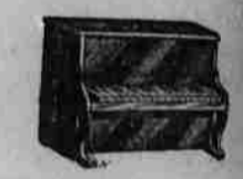
25c to $1.00.