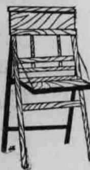
Blackboards 10c to $1.00.