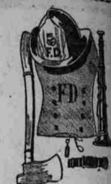
25c and 50c.