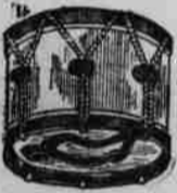
10c to $1.00.