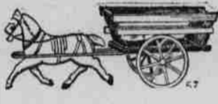
10c to 25c.