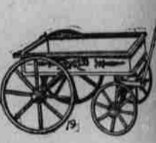
10c to $1.00.