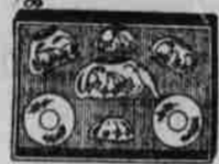
10c to 50c.