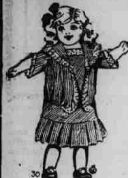
10 cents to $1.25.

FIVE MINUTES SPENT IN OUR STORE WILL GIVE YOU A BETTER IDEA OF THE MANY THINGS WE HAVE TO OFFER THAN WE COULD HOPE TO TELL YOU HERE.