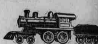
10c to $1.00.