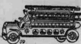
10c to $1.00.