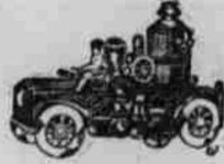
Mechanical toy, 50c.