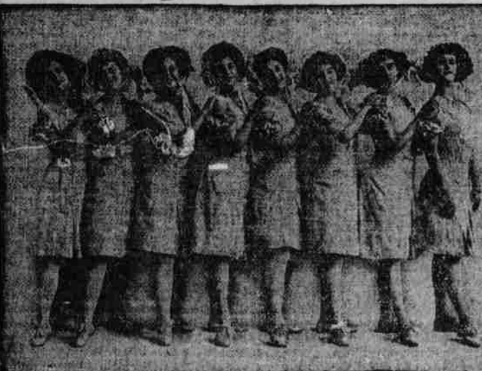
THE DANCING EIGHT WITH "THE PRINCE OF TONIGHT," AUDITORIUM NEXT MONDAY, MATINEE AND NIGHT.

Overflowing With Song Hits and Stunning Girls Excellent Cast—40 People TOM ARNOLD, Pony Ballet of Clever Dancers—A Singing, Dancing, Merry Girl Show. 260 TIMES AT THE PRINCESS IN CHICAGO. PRICES—Matinee: Lower Floor, 75 and 50c; Balcony, 75 and 50c; Gallery, 25c; Children any seat, 25c. NIGHT—50, 75c, $1.00, first nine rows $1.50. SEATS SELLING AT ALLISON'S DRUG STORE.