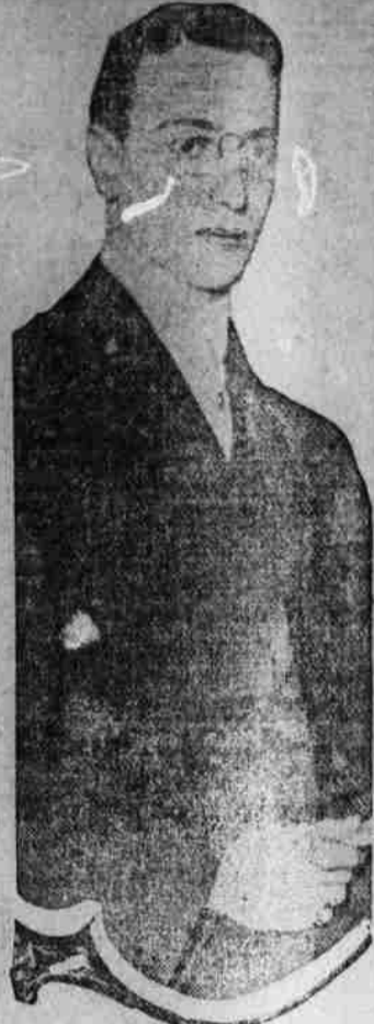
LEO M. FRANK.

London, Jan. 27.—(Correspondence of The Associated Press.)—Three hundred stations for the collection of money to supply eggs for the wounded soldiers have been opened in London, and more than 5,000 eggs are being distributed daily in the hospitals at the front.