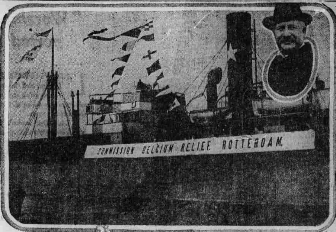
The S. S. Haskinonge, first of the vessels chartered by the American Commission for Relief in Belgium, with a cargo of 253,000 bushels of wheat for the Belgians.

"It looks as though my marriage with Miss Mullins would have to be postponed." "What's the matter, old fellow?" "She got married to young Dobson yesterday."