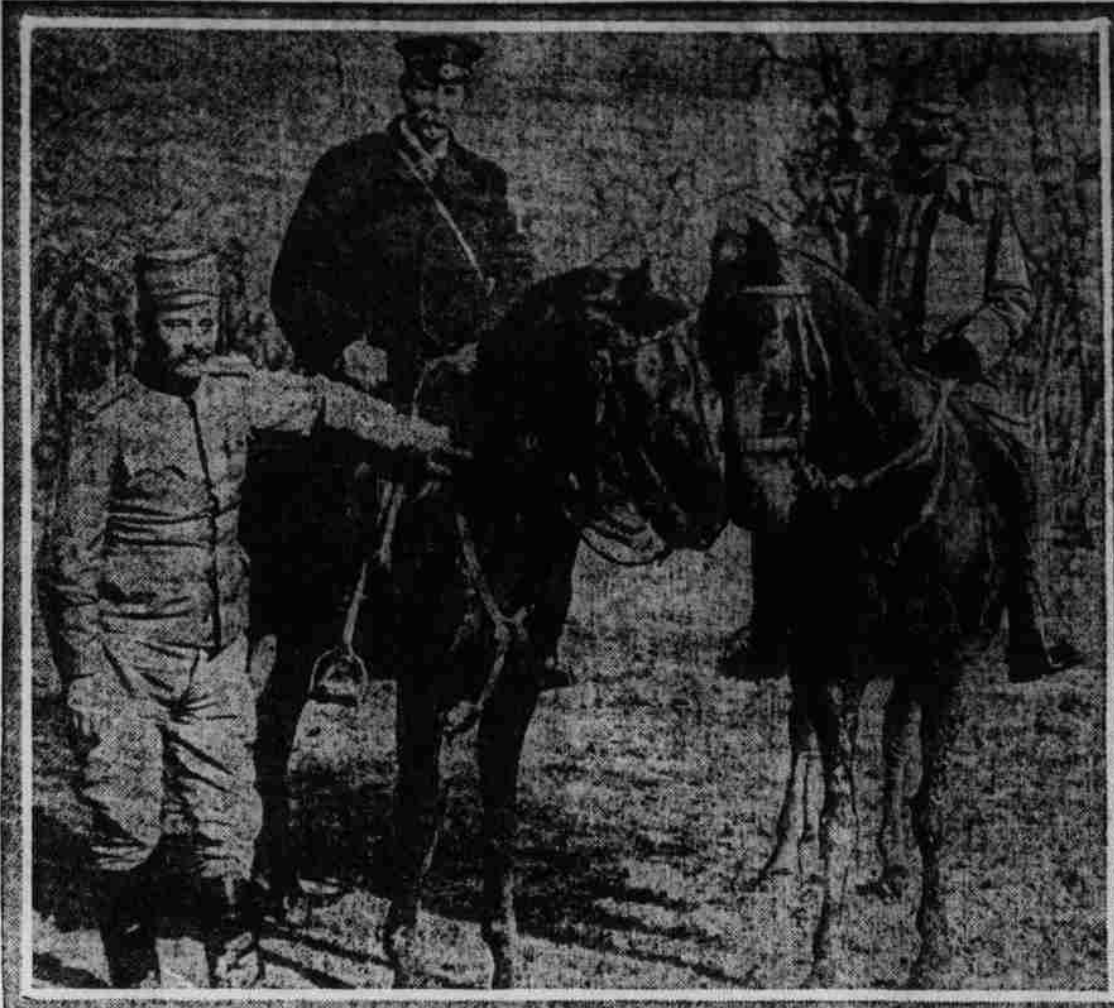
SIR THOMAS LIPTON AT BELGRADE, DEFENDER