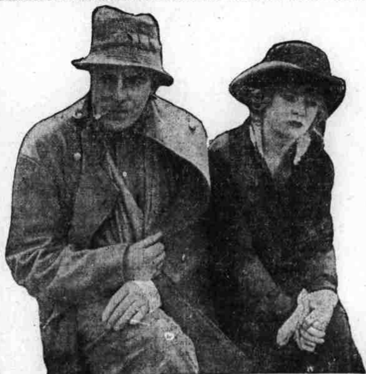
BLANCHE SWEET AS "MARGERY HUNTLEY" AND HOUSE PETERS AS "DR. RICHARD CARLTON" IN "STOLEN GOODS" AT THE PRINCESS TOMORROW.

SPANISH MACKEREL, BLUEFISH, TROUT, BUTTERFISH, FLOUNDERs Virginia Fish & Oyster Co. Best Service. Phone 2296