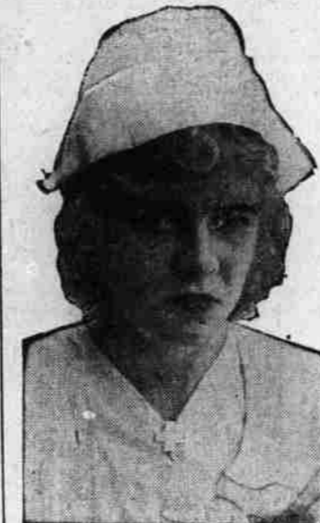
BLANCHE SWEET In "The Secret Orchard" at the Galax Tomorrow.

At The Galax. "For a Woman's Fair Name," a five part Vitagraph Blue Ribbon feature with Robert Edeson in the leading male role will be the attraction at the Galax today. In connection, "You Know Me All" will also be shown today. Tomorrow, Blanche Sweet will be seen in "The Secret Orchard" a Paramount picture. Daughter of one of the stars of the Parisian demi-monde, the heroine of "The Secret Orchard" carries from birth a hidden taint of character, the more concealed because of the sweetness of her nature and the beauty of her personality. From a convent in which her mother, who had died, placed her as a child to escape the environment of her parent,