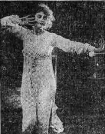
Billie Burke in Pajamas in the New Triangle-Fine Arts Romantic Comedy "Peggy."

Nowadays we simply ask at any drug store for "Wyeth's Sage and Sulphur Compound." You will get a large bottle of this old time recipe improved by the addition of other ingredients for about 50 cents. Everybody uses this preparation now, because no one can possibly tell that you darken your hair, as it does it so naturally and evenly. You dampen a sponge or soft brush with it and draw this through your hair, taking one small strand at a time; by morning the gray hair disappears, and after another application or two, your hair becomes beautifully dark, thick and glossy and you look years younger. Wyeth's Sage and Sulphur Compound is a delightful toilet requisite. It is not intended for the cure, mitigation or prevention of disease.