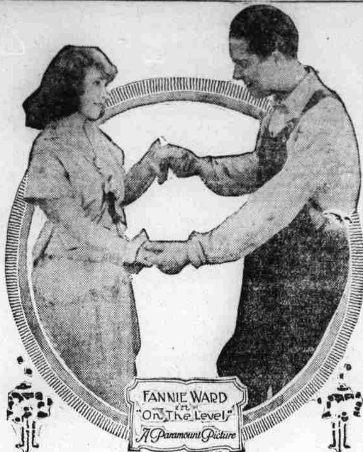
At the Strand Tuesday and Wednesday

Tommy worked a while longer, and then his face brightened up wonderfully. "Still," he said, "if she wanted to give us something, she could, couldn't she?"