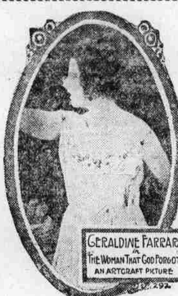
At the Strand Friday and Saturday.