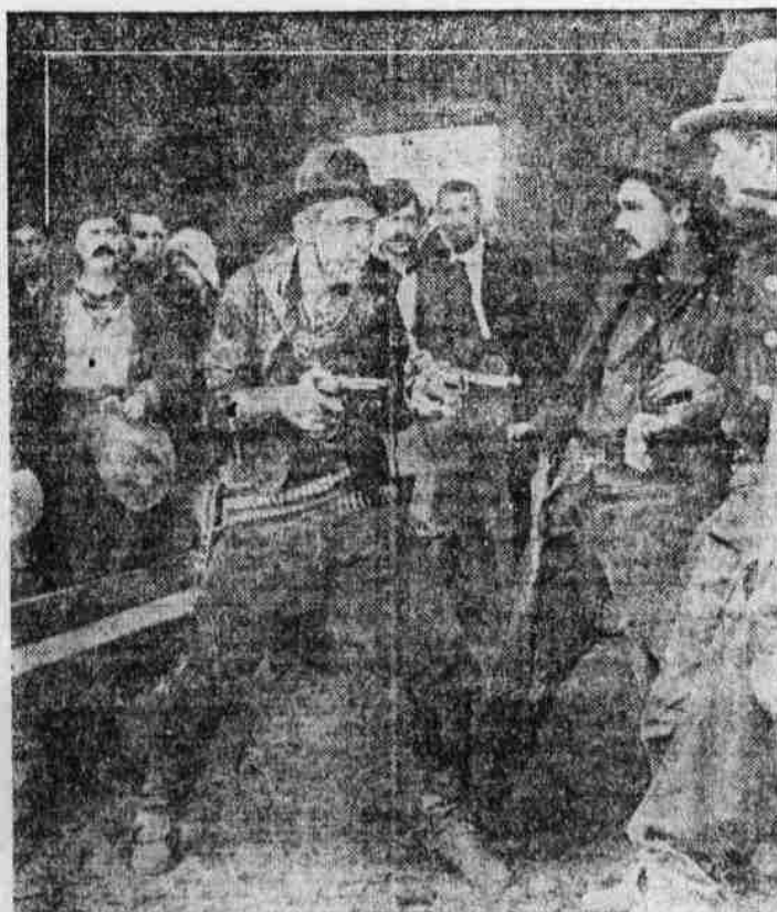
WILLIAM S. HART IN TRIANGLE PLAY, "HELL'S HINGES."

More or less time should be given to sanitary matters around the house. When the family dog dies or you have poisoned off a dozen rats, throw the bodies over in your neighbor's back yard instead of leaving them around your back door. The body of a dead horse, left in the front yard, may cause sickness in the whole neighborhood.