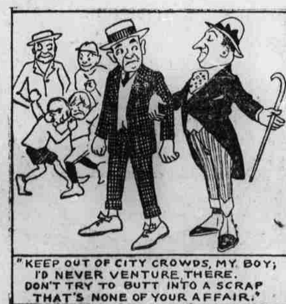
"KEEP OUT OF CITY CROWDS, MY BOY, I'D NEVER VENTURE THERE. DON'T TRY TO BUTT INTO A SCRAP THAT'S NONE OF YOUR AFFAIR."