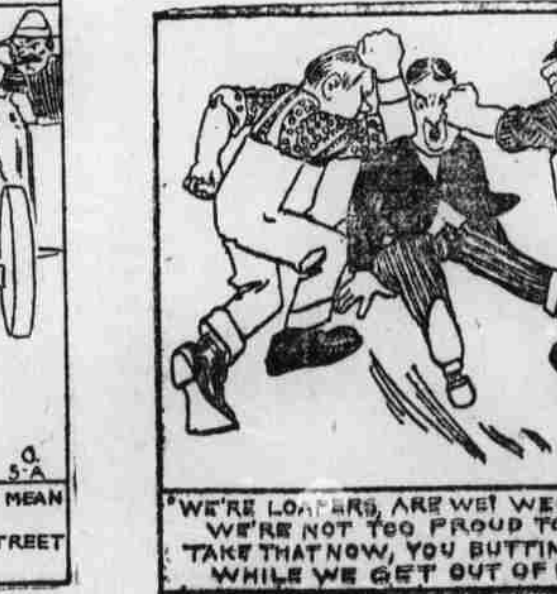
"WE'RE LOAFERS, ARE WE? WELL BEHOLD! WE'RE NOT TOO PROUD TO FIGHT, TAKE THAT NOW, YOU BUTTINGKI GUY, WHILE WE GET OUT OF SIGHT!"