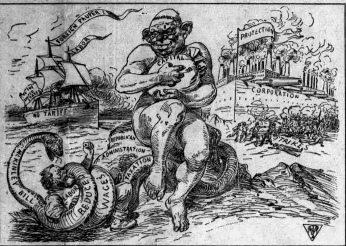
"Why, man, he doth bestride the world like a Colossus."—Shakespeare.

That is the serious question the Southern people have to decide. There are three, we may say four, parties in the field soliciting their votes. The Republican party is willing and determined to oppress them, if given the power. The third and fourth parties are willing, we concede to protect them from force bill legislation, but do not claim the power in the near future. The Democratic party is willing, has had the power heretofore, to protect them, and claims that it will, with an undivided vote in the South, continue to have that power. Which party will the Southern people favor under the circumstances? The Republican party is out of the question with the voters we are addressing. The third and fourth parties are willing to protect the South from hostile legislation, but lack the power, while the Democratic party both has the will and by standing together will be given the power to give peace to our section, as it has shown by its acts in the past. Defection from the Democratic party is death to Southern liberty.