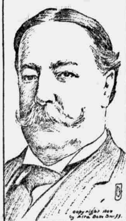
WILLIAM HOWARD TAFT.