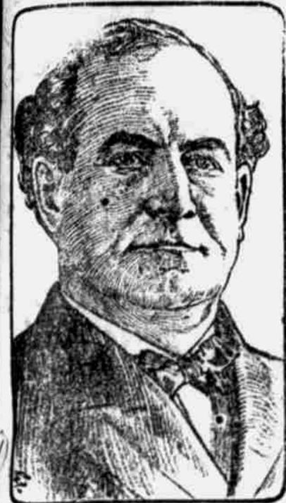
WILLIAM J. BRYAN.