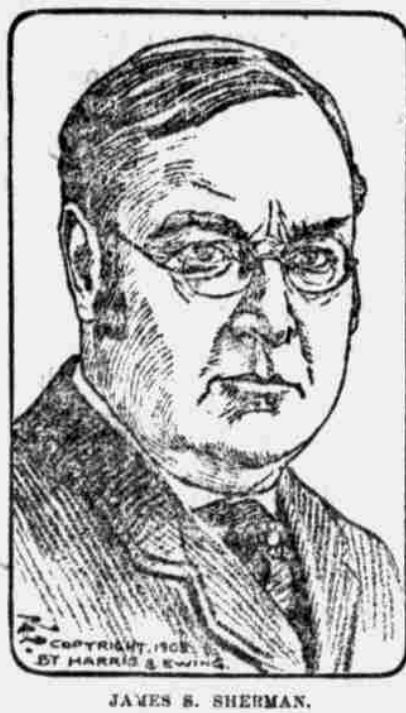
JAMES S. SHERMAN.