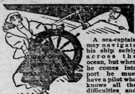
A sea-captain may navigate his ship safely across the ocean, but when he comes into port he must have a pilot who knows all the difficulties and dangers of that particular channel.

There are no better medicines on the market than Chamberlain's. We have used the Cough Remedy when all others failed, and in every instance it proved effective.