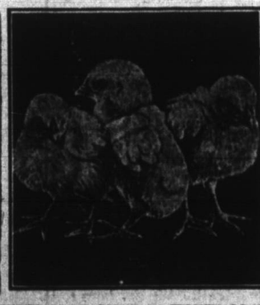
SNOWDRIFTS HATCHED ON CHRISTMAS DAY.

natural, they lie content like little lambs and play peep with you from the hover. If languid at noon, it's lamp fumes, soot, bad air, too much heat or supper or lice, and crushed chicks show that heat's too low. When chick begins to assert itself, cots, ruts, scratches, you begin to modify temperature more and more as chick is able to bear it, letting in abundance of fresh air without drafts and later letting them run into a dry outside apartment, free from drafts, open on top to free air and sun. Winter furnishes no worms, bugs, seeds, grass, grit, so you must nature fake. Let chick assimilate yolk first day, then scatter a little grit and fine dry sweet breadcrumbs. Lead from this to good chick feed, then on to wheat and cracked corn, grain always thrown into the litter to induce exercise. Cottage cheese, fine cut bones, raw meat and beef scraps are substitutes