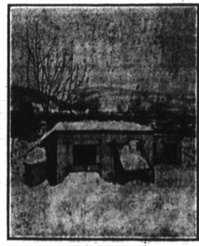
A BROODER IN A HEATED-85 DEGREES BELOW ZERO.

Here's to the hero who braves blow, snow and zero and raises broilers in nature's danger zone! Your first attempt at brooding chicks in snowdrifts? Well, keep your peepers on the peep, furnish the judgment, and here are the main principles. Remember this is a nature fiasco stunt. Winter affords no range. Thus extra room for air and exercise is essential. A brooder 6 by 3, with high, roomy cover and floor on one level, will house thirty to forty chicks, breed considered, until weaned from heat and moved to dry, cozy quarters. Bed with sandy loam until chicks know food from indigestibles, then use cut clover, alfalfa or straw in sun parlor for scratching. Bird babies sleep much at first and must have warm, even temperature. Use a regulator on hover, heat from 90 to 100 degrees at first, chick's actions the indicator. Too cold, the chicks pile up; too warm, they pant and desert hover;