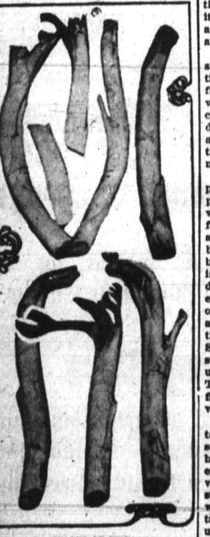
STALKS OF UDO.

Introduced Here From Japan and Called Better Than Asparagus. Writing in the National Geographic Magazine on "New Plant Immigrants," David Fairchild says the following of udo, a Japanese vegetable similar to asparagus: "On the streets of any Japanese city you will find for sale an attractive bleached vegetable called udo. It is a plant in New England the asparagus, but a much larger plant. There are many ways in which it is prepared by Japanese and the foreigners who live in Japan, but either as a salad or cooked in the same way in which asparagus is cooked it deserves to rank as one of the important vegetables of the world. It is easy to grow; it does not require replanting often than once in nine or ten years; it can be cropped in the autumn or in the spring, and it yields large crops of shoots, which are often two feet long and an inch or more in diameter at the base. These bright white shoots are edible to their very bases without the least objectionable fiber and not in this respect like asparagus, of which only the tips are fit to eat."