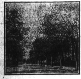
ELMS IN EAST ORANGE, N. J.

A Thorough Knowledge of Local Conditions is Essential in Making the Choice—American Elm and Red Oak Next in Line. "If you were asked to select the six species of trees best adapted for planting in the residential streets of your city, what species would you choose, and why?" A table has been compiled from replies received from ten representative city foresters and shade tree commissioners to the above question, submitted to them by the editor of the American City. As each forester was given six votes, a total of sixty choices was recorded, the highest possible number of votes for any one species of tree being ten.