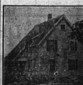
EXCELLENT SCHOOL CONDITIONS IN MARCHINGTON TOWN.

Today there is hardly a more beautiful sight in the great southwest than Spring park, and what was hidden from the sight of the stranger and visitor in days gone by is now pointed out with satisfaction and pride as one of the chief assets of the city—American City.