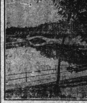
SPRING PARK AS IT IS NOW.

The rough bluff on one side of the lagoon was broken by terraced steps of cement, on which the people could sit