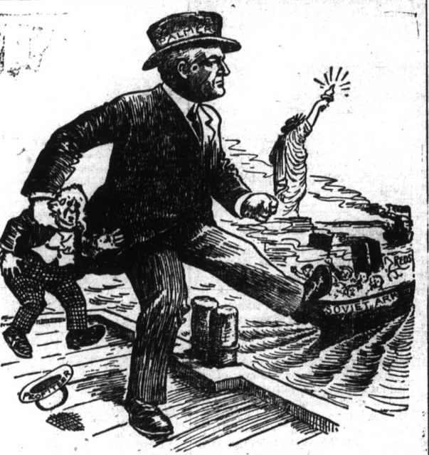
The Fighting Quaker