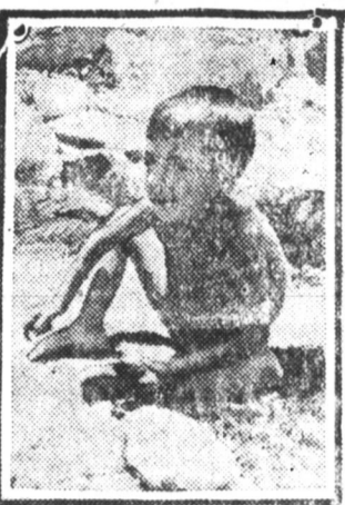
Disfigured by starvation, his body covered with scabies, this tot was found by Near East Relief workers in Armenia, digging for roots and herbs to keep alive.