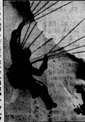
Member of the "Caterpillar Club" earns his right to membership by 5000 foot Emergency Jump.

What is the matter with these brave people when they are not up to par? The natural poisons in their bodies have not been swept away. They are allowing their brains to be clouded and dulled by poisons which should not be permitted to remain in the body.