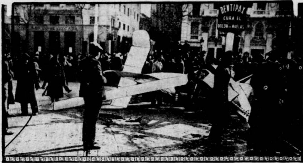
An autogyro piloted by Lieutenant Guitian landed in the center of the city of Barcelona, Spain, during an aviation fête, but in an effort to rise again, was cramped for space and crashed in the midst of the crowd watching the events. The pilot was slightly hurt. Photograph shows the autogyro after the crash.