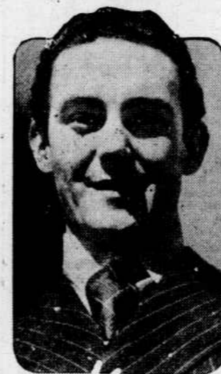
Jack Doyle, prominent heavyweight from Ireland, now visiting in this country. He will meet various leading lights of the American ring.