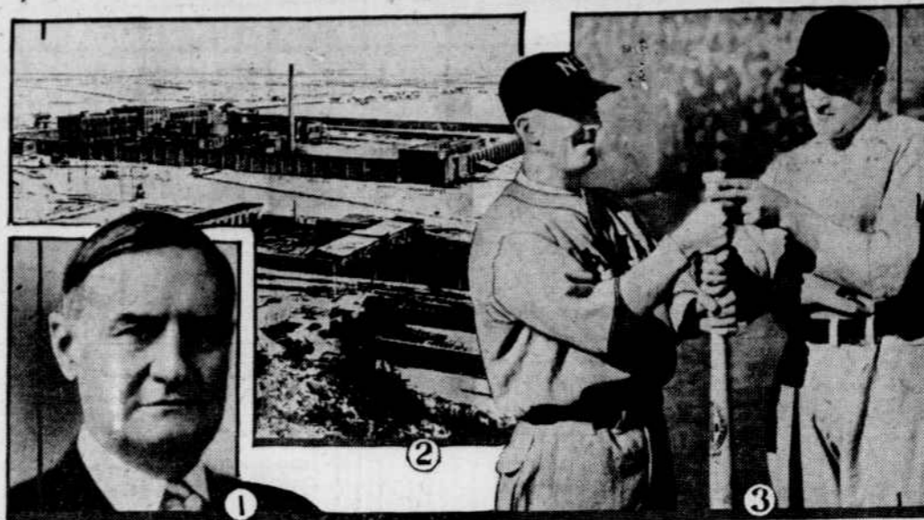
1.—Gen. Robert E. Wood, named head of a board to advise the President regarding administration of the $4,880,000 work relief fund. 2.—Oklahoma state reformatory from which 31 prisoners broke out. 3.—Heralding the approach of the baseball season, Joe Cronin and Dick Bartell warming up for the training season.