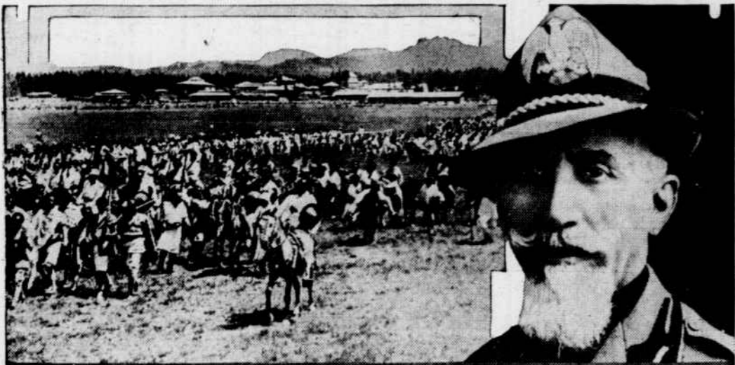
Ethiopian troops are here shown marching in parade as they were reviewed by their emperor recently as they returned after a successful clash with a rival tribe. Ethiopia has massed 30,000 troops on her frontier in answer to the demands by the Italian war council asking that Abyssinia salute the Italian flag as an apology for the recent killing by Abyssinian tribesmen of five native Italian Somaliland troops. Inset is photograph of Gen. Emilio de Bono, who is in command of the Italian troops massed on the Ethiopian border.