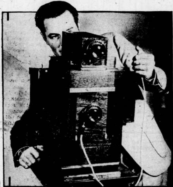
A camera which will photograph a subject in six different poses on the same plate has been invented by C. B. Austin, Los Angeles photographer. The camera has two matched lenses.