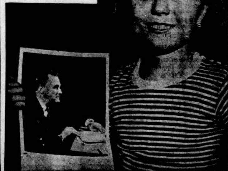
Shirley Temple, petite movie star, wears a big dimpled smile, caused by a letter which she received from President Roosevelt, appointing her his special messenger to deliver his autographed photograph to Bill Robinson, colored dancer, who appears with her in a current release. The President also included a personally signed photograph for Shirley.