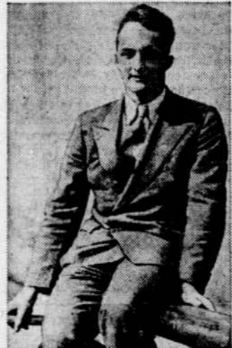
for Europe to take part in the winter Olympic games. He will compete in the ski jumping at Garmisch-Partenkirchen, Germany.