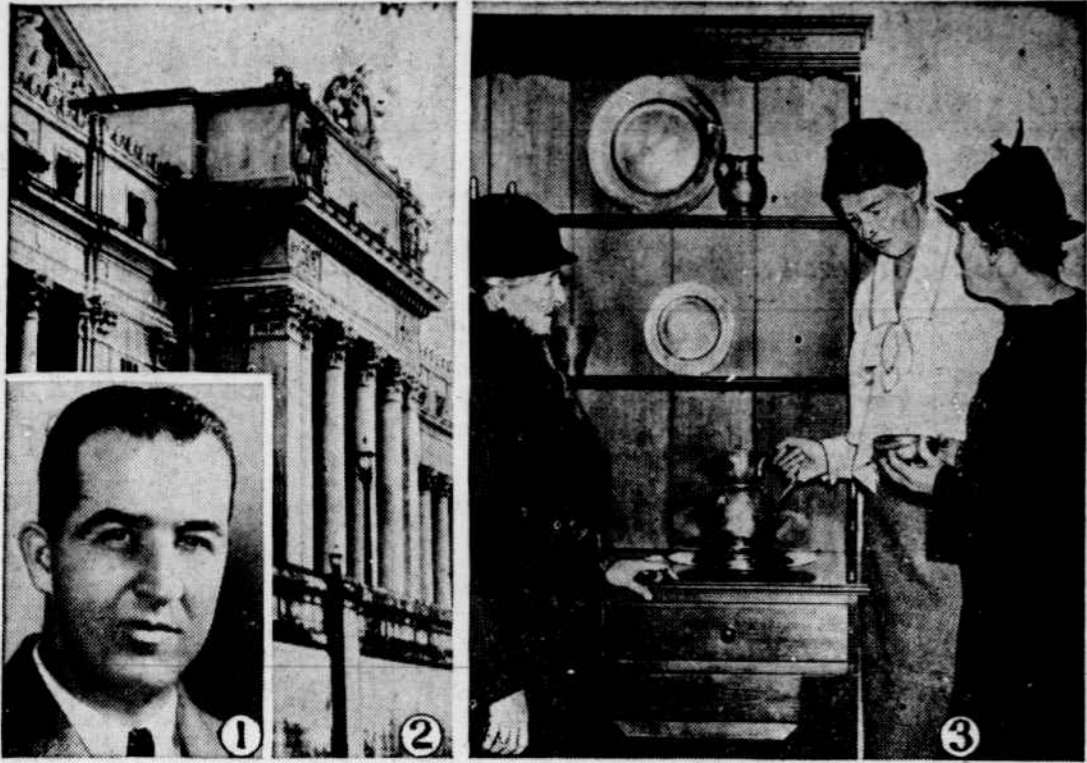
1—Albert B. ("Happy") Chandler, Democrat, who was elected governor of Kentucky. 2—Beautiful facade of the Philippines legislature building in Manila where Manuel Quezon was inaugurated first president of the island commonwealth. 3—Mrs. Franklin D. Roosevelt acting as sales-lady at the exhibition and Christmas sale of Val-Kill furniture and metal crafts in New York.