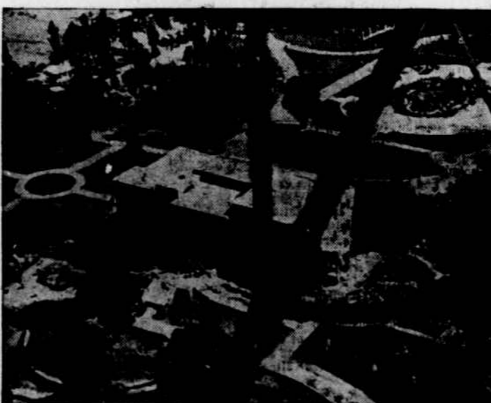
If the Italian invaders don't prevent it, Emperor Haile Selassie of Ethiopia will soon occupy this handsome new palace in Addis Ababa.