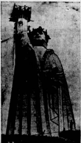
Statue of Liberty at New York, has been erected in Mexico in honor of Don Jose Maria Morelos, the famous priest who joined the independence movement in 1810.