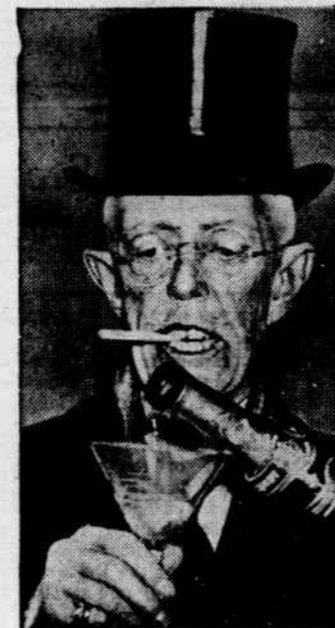
pouring a glass of champagne at the opening of a new restaurant.