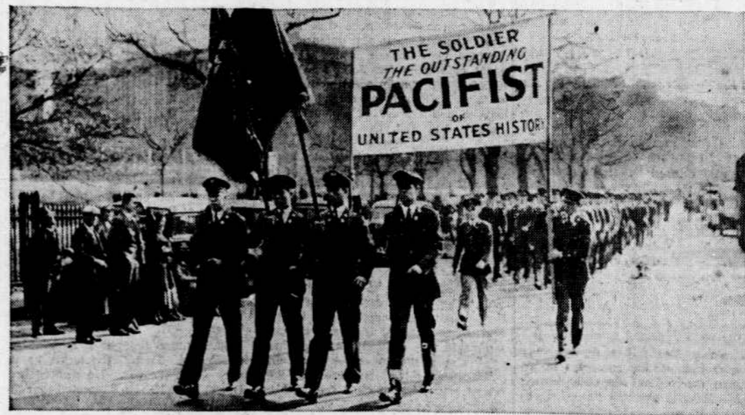
Marching in their R. O. T. C. uniforms as a gesture in support of military preparedness as best insurance against war, the student soldiers of Boston university made a dramatic appearance at the mall, at an anti-war meeting denounced as communistic by police. This picture shows the head of the university procession carrying flags and banners as it swung toward the common.