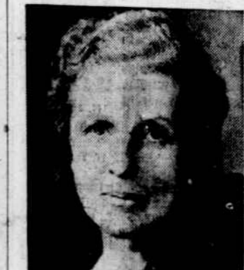
work activities in both the FERA and WPA. For ten years she was on the staff of the Family Welfare Association of America as associate field director.