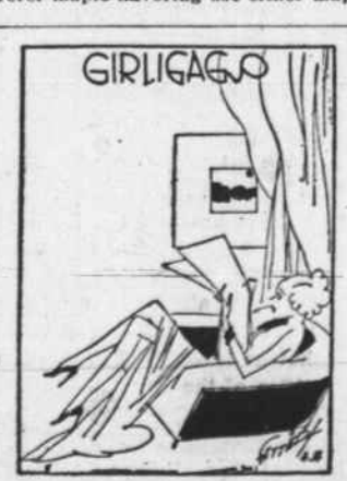
knowing Nora, "when they start throw ing plates instead of compliments." @ Bell Syndicate.-WNU Service.

Fudge Frosting. Cut fine two squares of chocolate and combine with two cups of sugar, one-half cup of milk and one-fourth cup of dark corn sirup. Cook until it forms a very soft ball when dropped into cold water. Remove from the fire set the pan in cold water and cool, then flavor and beat until thick enough to spread on the cake. For those who prefer maple flavoring use either maple