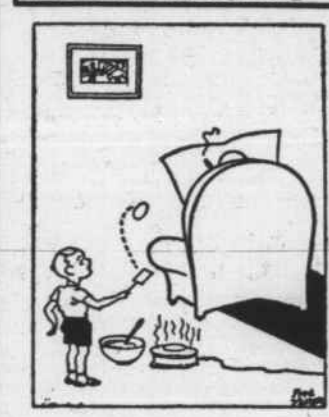
'Pop, what is a gypsy?"

been built just to make me go through one of those little gateways. If that's the case, I'm not going to do it."