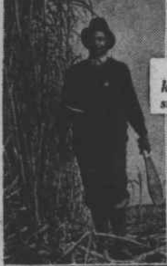
This worker knows how to cut sugar cane.

The girls at the left look very industrious, but they are only out for a frolic in the sugar cane.