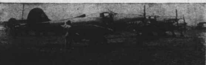
Shark-nosed army fighters such as these have combined with navy and marine planes to take a heavy toll of Jap aircraft in the continuing battle for the Solomons islands.