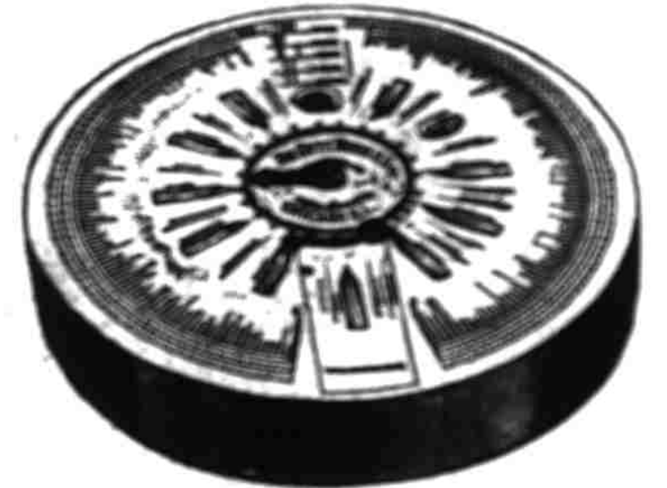
Needles, Shuttles and Bobbins for use in All Makes of Sewing Machines.

No need of further worry about getting needles and shuttles for your sewing machine; we carry them. This means for your machine.