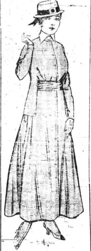
A Frock Severely Plain But Smartly Stylish.

The Dutch costumes are particularly suited to the young girl. They often have a broad strap over the shoulders, with a blouse buttoning straight down the center front. The skirt is full, with a slight bulging at the hips. Sometimes these dresses are topped with a short Dutch jacket. White or Deft blue are favored colors for this style of dress.