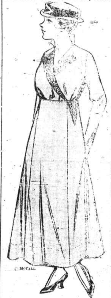
Braiding Proves an Effective Trimming on This Dress.

The hats of the year continue to be mostly small, although a few large ones are to be seen, and very smart