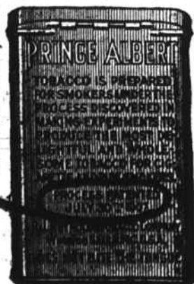
This is the reverse side of the Prince Albert tin. Read this "Patented Process" message, you will realize what it means in making Prince Albert so much to your liking.

R. J. REYNOLDS TOBACCO CO., Winston-Salem, N. C.