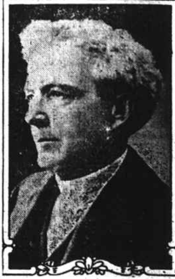
LUTHER BURBANK.

Announcing his support of President Wilson, Luther Burbank, the horticulturist wizard of California, said: "I believe him to be the greatest statesman we have ever had." Mr. Burbank, the Edison of scientific horticulture, declared that without reserve he endorsed the position announced a week earlier by Thomas A. Edison. Both Burbank and Edison have