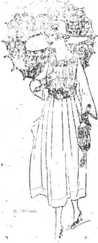
Afternoon Frock of Chiffon Trimmed With Taffeta

The accessories of dress to which so much importance is usually attached are more deserving of our attention at this time of the year than ever. So much that is new is being brought out for spring and summer that we cannot afford to pass them over without consideration. The perfect-fitting shoe and glove, the veil with just the right mesh to be becoming, the parasol of the smartest shape, and the bag of the newest size and outline, are all of paramount importance.