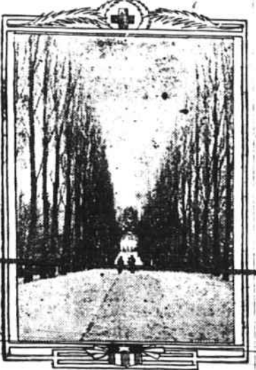
Entrance to American Red Cross Hospital at Kiev.

PAUL-GALE-GREENWOOD CO. Inc. "Largest Jewelers South" Granby Street, Corner City Hall Ave. NORFOLK, VIRGINIA