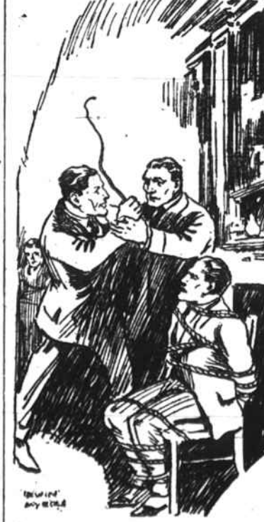
"Stop it, Lakington." His Voice Was Stern as He Caught the Other's Up-raised Arm.

met those of the raving man in front of him without a quiver, and at last Peterson himself intervened. "Stop it, Lakington." His voice was stern as he caught the other's up-