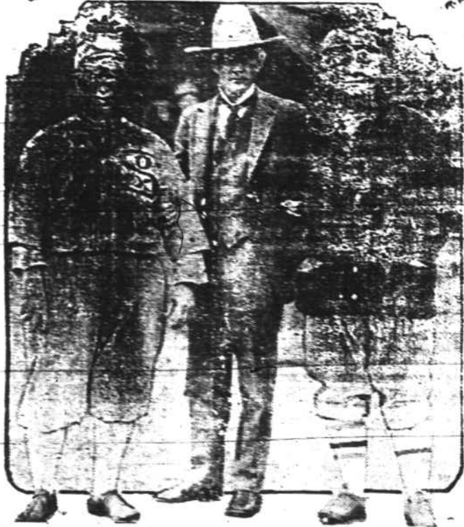
LOOK from left to right and you see Kid Gleason, Chicago White Sox chief; Judge K. M. Landis, baseball chief-in-general, and John J. McGraw, New York Yankee chief—Landis is one of the really big men in baseball, and his picture partners aren't so small either. The judge is wearing a hat presented him by the state of Texas.