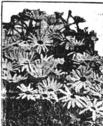
The Daisy—The American Legion's Official Flower.

From the standpoint of economy, the plantings around the foundations of the house should, as a rule, be made of permanent low-growing shrubbery, mainly that which grows native in the locality, and the annual flowering plants given a place in connection with