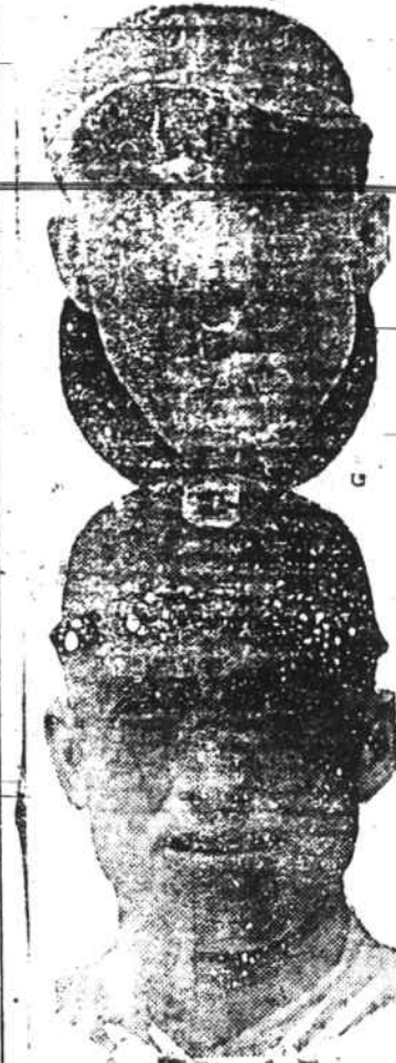
JOE DUGAN (ABOVE), AND ELMER SMITH.

DASHBELL fans and sports editors throughout the country clamored protest when it was announced recently that Joe Dugan, star third baseman, and Elmer Smith, outfielder, had been traded to the New York Yankees by the Boston Red Sox. It was claimed that they had made a willingness to be part of manager Franck's trade to the Yankees. Also that it was a "sneak" trade. They are not to be taken seriously. They will be a source of spending cash when the race gets warm.